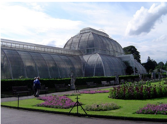
Royal Botanical Garden Kew