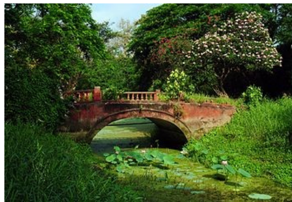
Sibpur Botanical Garden Kolkata