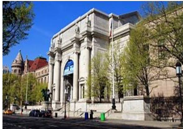
National Museum of Natural History NY USA