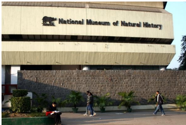
National Museum of Natural History New Delhi

Museum of Mumbai natural history society (Hornbill House, Shaheed bhagat singh road Mumbai